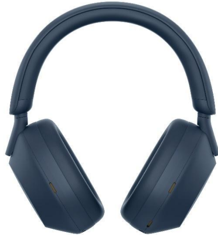
WH-1000XM5 Midnight Blue