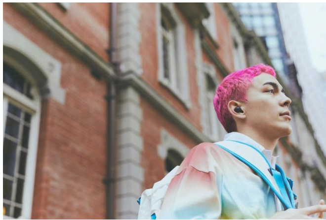
Designed with comfort and stability in mind

The WF-C700N has been designed with comfort and stability in mind, no matter the size of your ears. Sony has designed the WF-C700N by utilising extensive ear shape data collated since it introduced the world's first in-ear headphones in 1982. The WF-C700N earbuds combine a shape to perfectly match the human ear with an ergonomic surface design for a more stable fit, so you can listen for longer without needing a break.