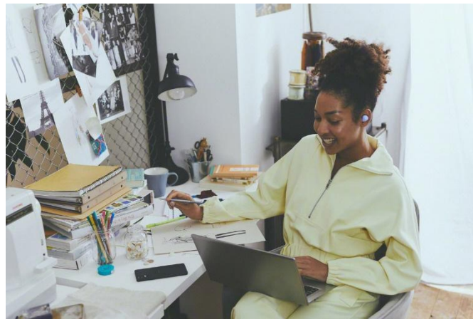
Reliable call quality

The WF-C700N also provides reliable call quality thanks to the Wind Noise Reduction Structure which delivers your voice clearly, even on a windy day.